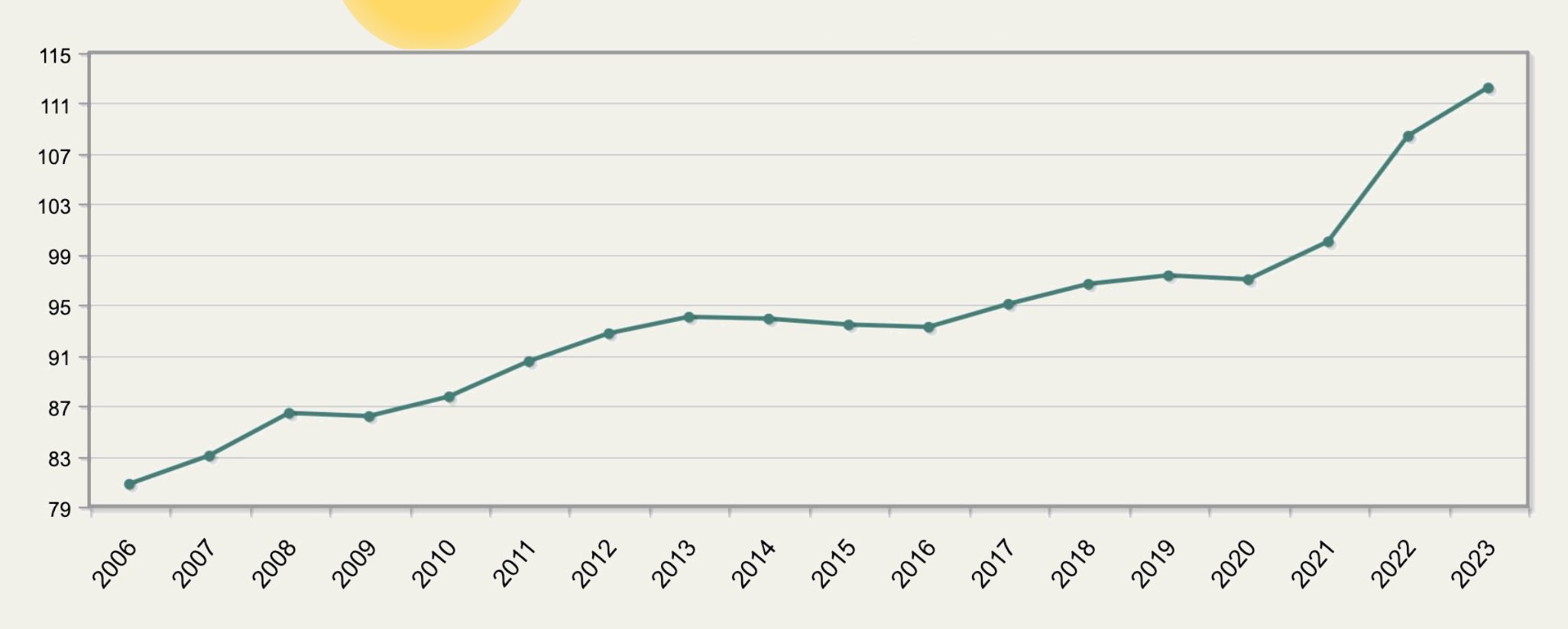
The CPI tracks changes in categories like food, energy, transportation, and housing.